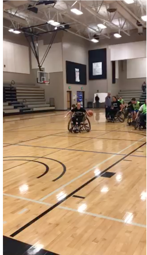
(Video – press to play)